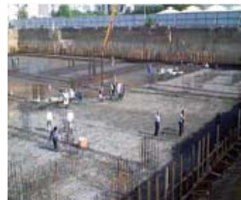
Dry sprinkling of Vandex Super at the rate of 1.5kg/m 2 .

Vandex Super was sprinkled dry over a sieve with a mesh of 1mm.