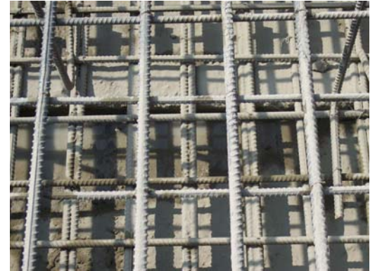
Construction site St. Mina Church

Project Name: St. Mina Church Scope: External Waterproofing City: Cairo Country: Egypt Vandex Applicator: Sodeco Specialties S.A.E Construction Period: 2006 – 2007 Consultant: Moharram Bakhoun Consulting Office